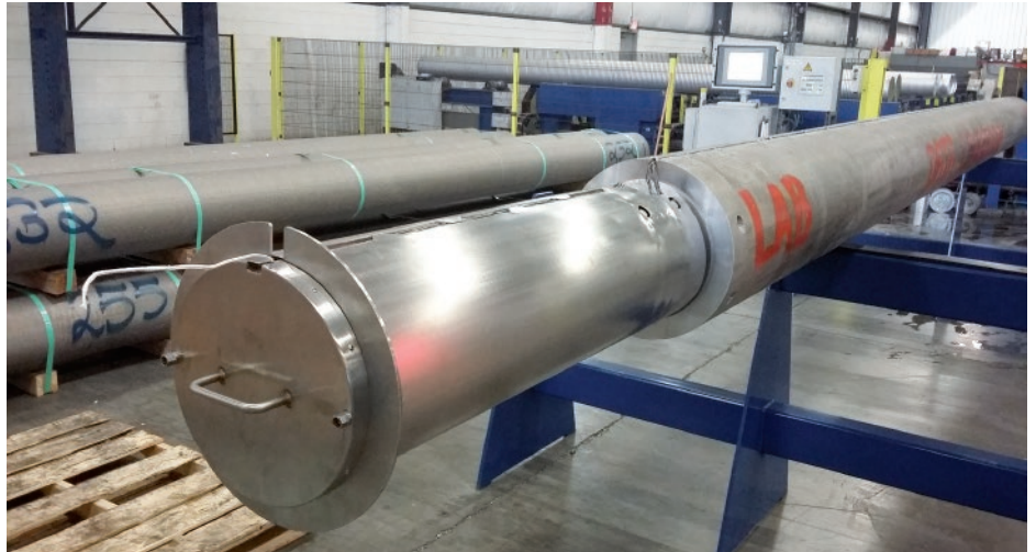
Figure 2. PhoenixTM TS57 Rotating water barrier solution set-up - System is used to successfully routinely monitor in real time the homogenisation of cast aluminium logs in Service Center Metals (SCM) walking beam furnaces. Rotating cylindrical water barrier is attached to a 356 mm / 14" log with thermocouples positioned along its length at varying depths.

The data logger is encased in a thermally insulated cylindrical water tank employing evaporating water as a phase change medium. As the water reaches its boiling point it changes from liquid to gas (steam) as it evaporates, but maintains the operating temperature of the logger at a safe 100 °C / 212 °F, so prolongs the period it can remain in the furnace. The barrier design must allow the steam to