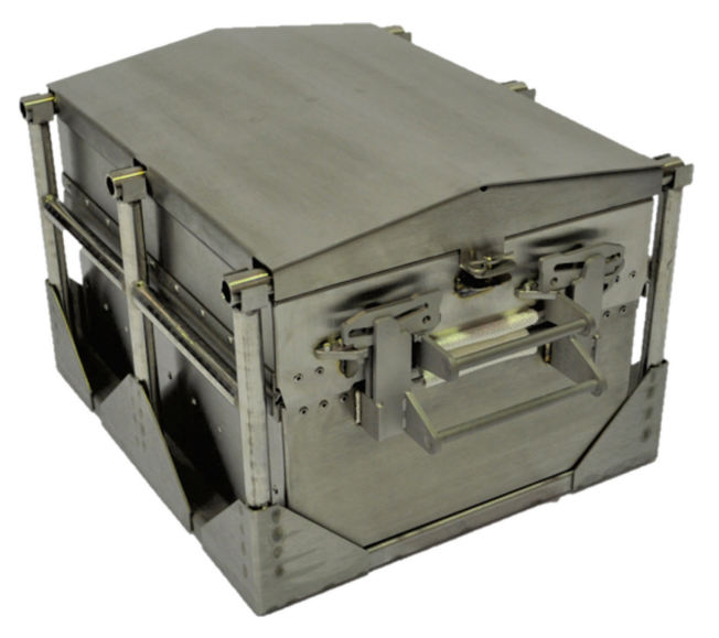
Fig.2 — Thermal barrier fitted with quench deflector designed specifically for surveying LPC batch furnaces with high pressure gas quenches.

A common process in today's heat treatment industry is the carburizing of lower cost steel products for use in the automotive industry. To achieve this process a popular heat treatment technology used is a sealed gas carburizing