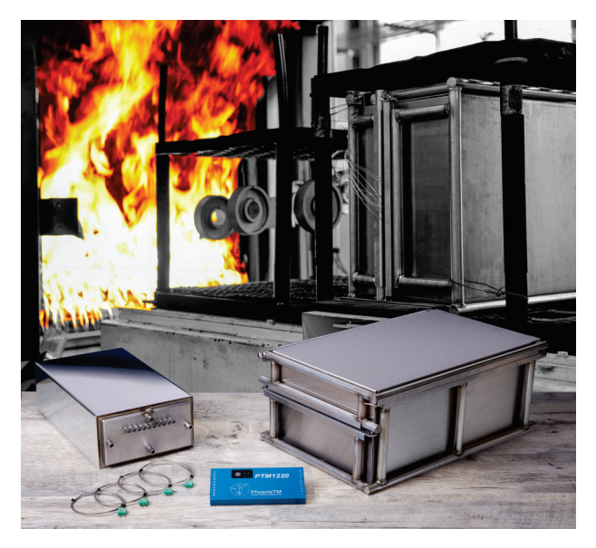
Fig. 4 — Thru-process temperature monitoring system for use in sealed carburizing furnace with integral oil quench. To the left is the inner sealed thermal barrier and data logger and on the right is the outer structural frame containing sacrificial insulation.