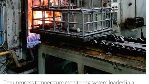
Thru-process temperature monitoring system loaded in a product basket traveling into and through a continuous sealed gas carburizing furnace.

Although the operating principle of these systems seems relatively straight forward, with the evolution of furnace technology and drive for automated systems, the design is often complex, as the thru-process system needs to meet the unique challenges that come with different heat treatment processes.